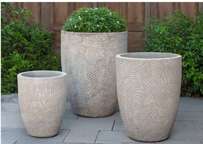
Shown in Caribbean Sand