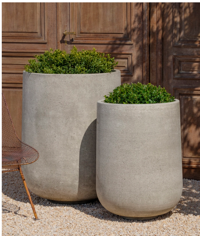
Shown in Greystone