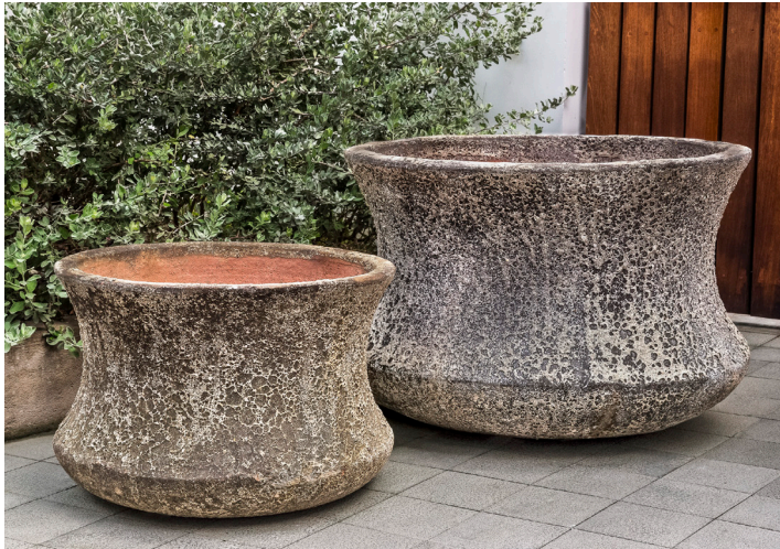
Shown in Aegean