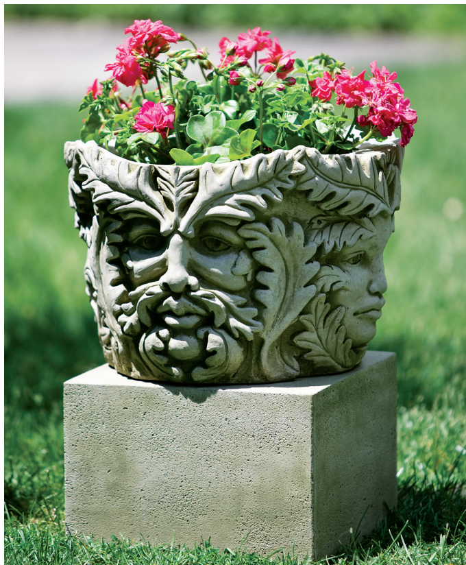
PD-174 with P-499 shown in English Moss