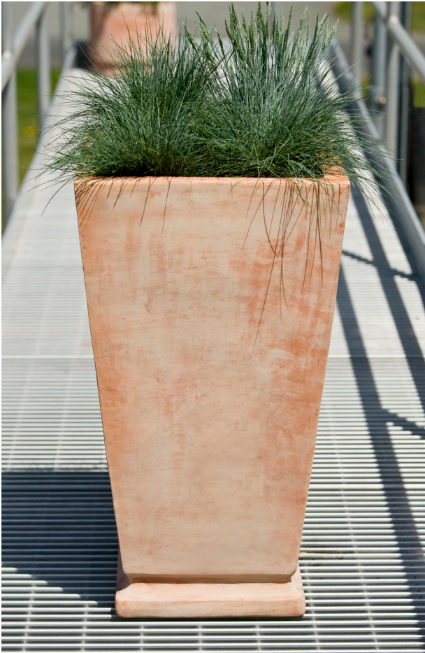
Shown in Terra Cotta