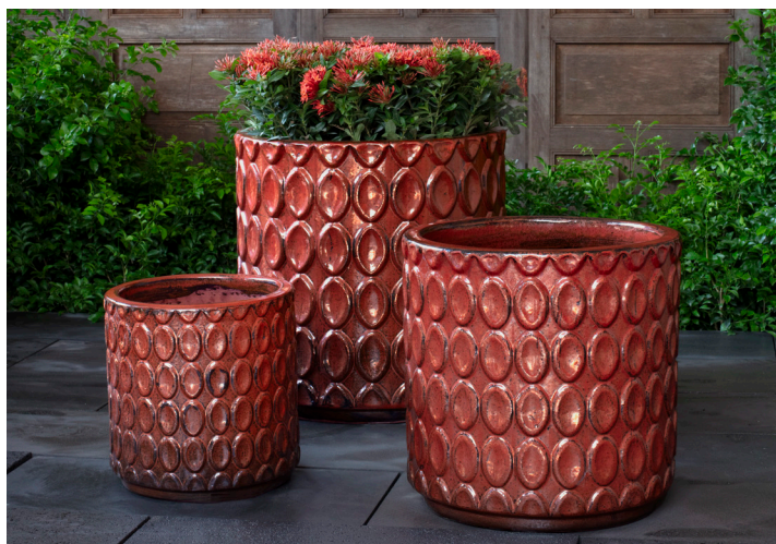
Shown in Brunello