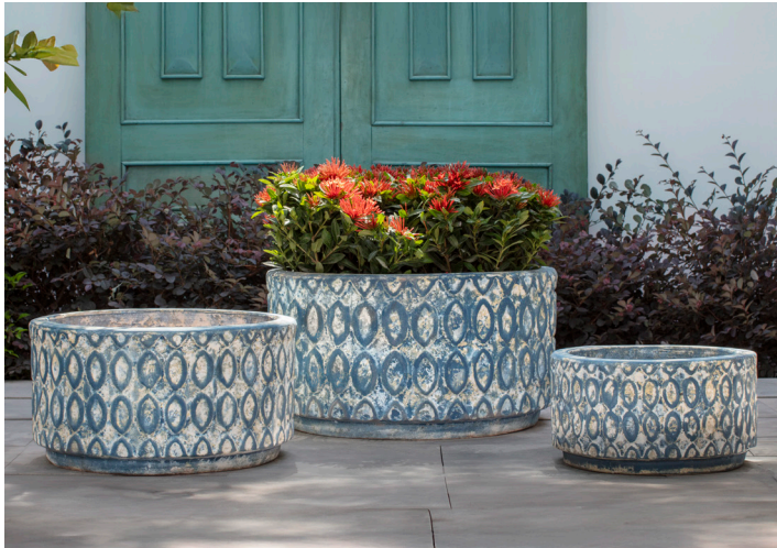
Shown in Murano Blu