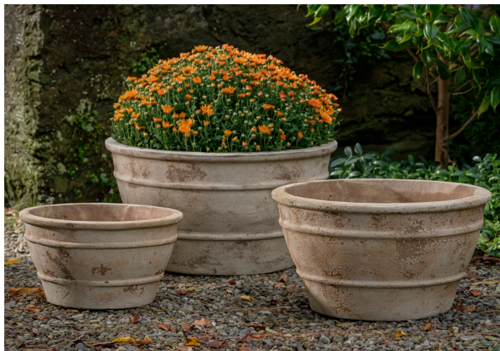
Shown in Antico Terra Cotta