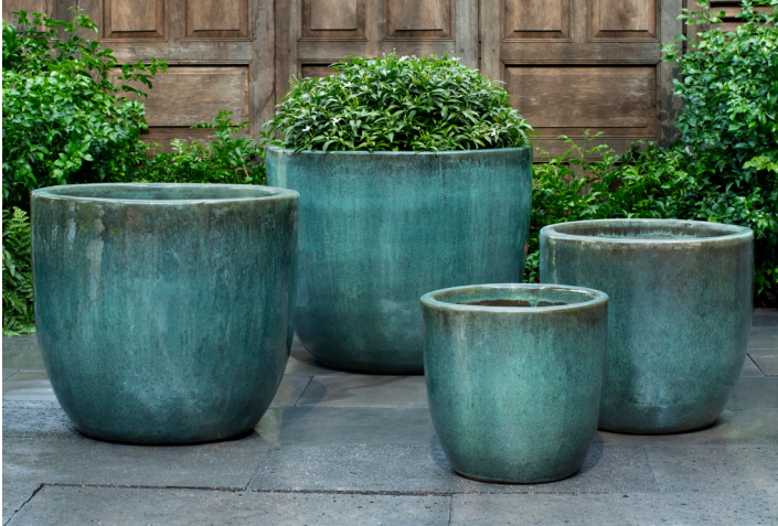
Shown in Antique Jade