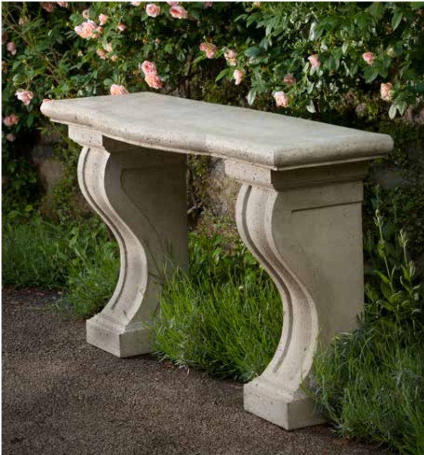
T-113 shown in Greystone