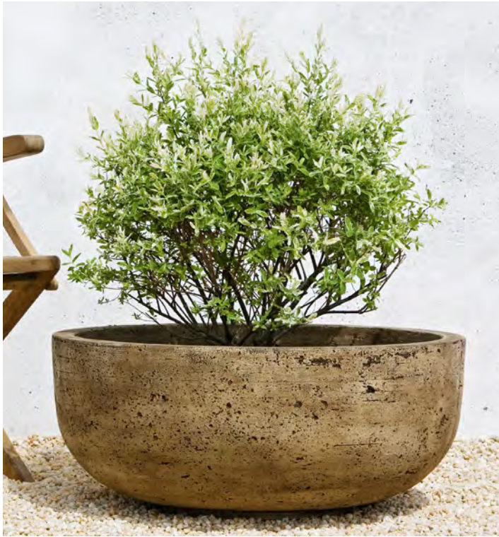
Shown in Brownstone