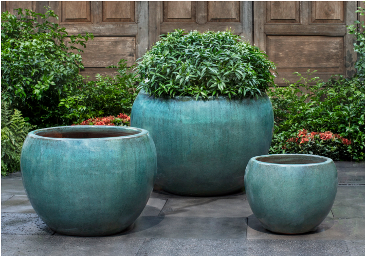
Shown in Antique Jade