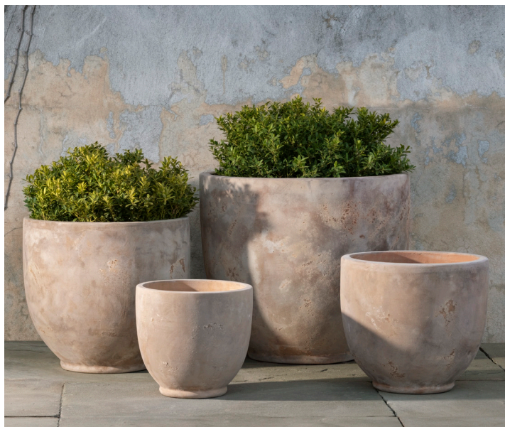
Shown in Antico Terra Cotta