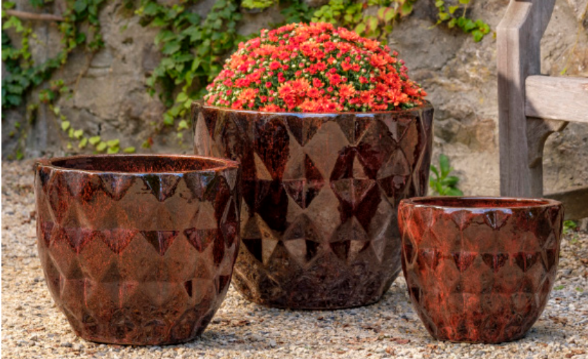
Shown in Bordeaux