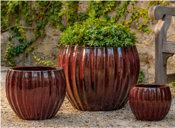
Shown in Bordeaux