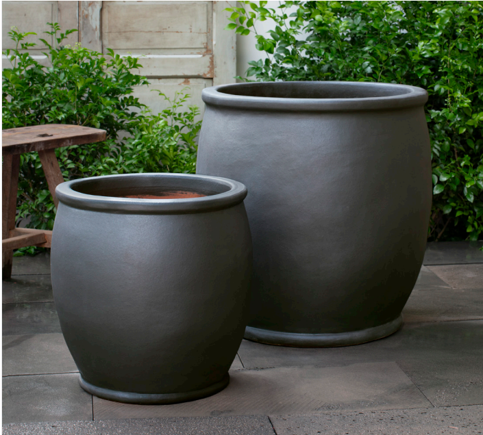
Shown in Ash