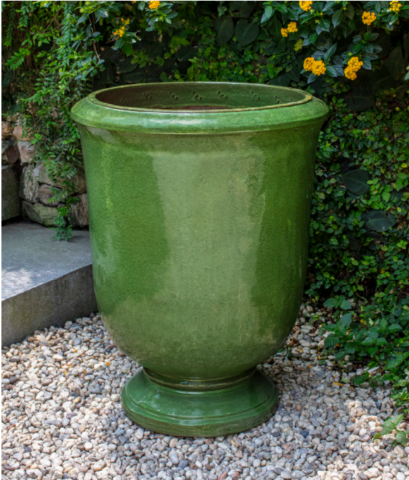
Shown in Erin Green